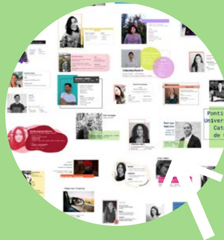
W.S. first-phase selected projects